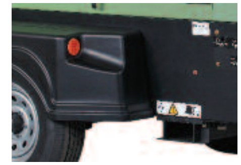
Optional Fork Lift Pockets Loading/unloading machine onto trailer via forklift is made easy.