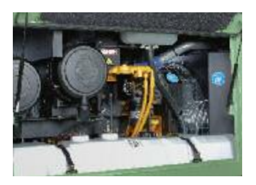
Total Accessibility Routine maintenance is simplified.

• Meets US EPA sounds requirements of 76 dBA @ 7meters