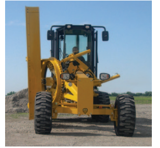
Dozer blade 90° Bank slope saddle